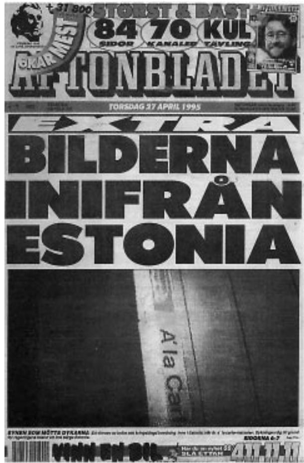
The front page of Aftonbladet, 27th April 1995.